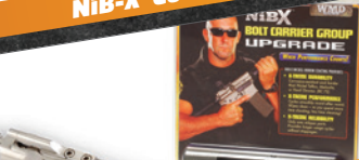
NiB-X® BCG Kits