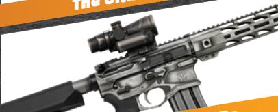
The Beast® NiB-X® ARs