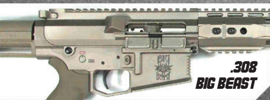
.308 BIG BEAST