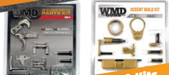
Coated AR Parts & Kits