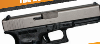
NiB-X® Coated Glock